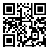
San Marcos Embassy Suites

Scan QR Code with your smartphone to register online using your TEEX Student Portal